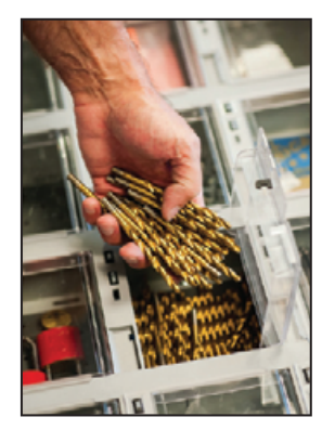
SupplyScale calculates the quantity of items added or removed.

Contact your Sales Rep for additional information.