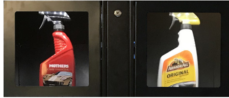
Top 2 Storage Compartments 13.75"H x 14.90"W x 23.75"D