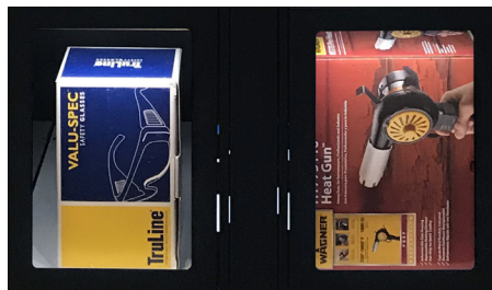
Bottom 2 Storage Compartments 13.75"H x 14.90"W x 23.75"D

All dimensions represent the maximum usable storage space.