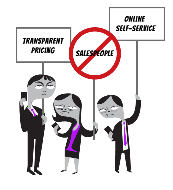
Millenials and Gen Xers are bringing new expectations to the workforce

Even today, more than 46% of small and medium enterprises still operate a manually enabled warehouse management and inventory tracking system. This leads to a wide range of errors and inefficiencies centered around order receiving, picking, labeling, packing, and shipping — all responsibilities that