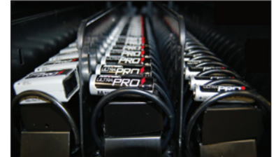
Battery dispensing module available