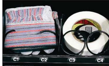
Dual motor helix examples

The key to flawless dispensing is having the right dispense aids combined with industry knowledge and experience. SupplyPro experts work with you to ensure that your facility's individual dispensing needs are met accurately and efficiently.